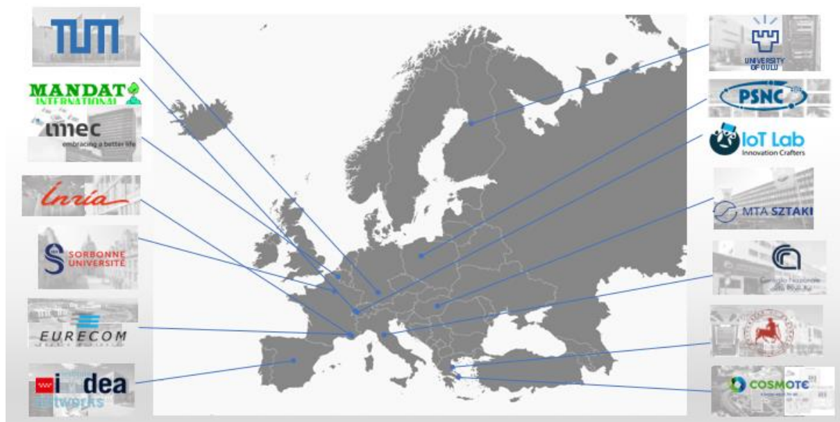
Figure 1. SLICES-SC Facilities